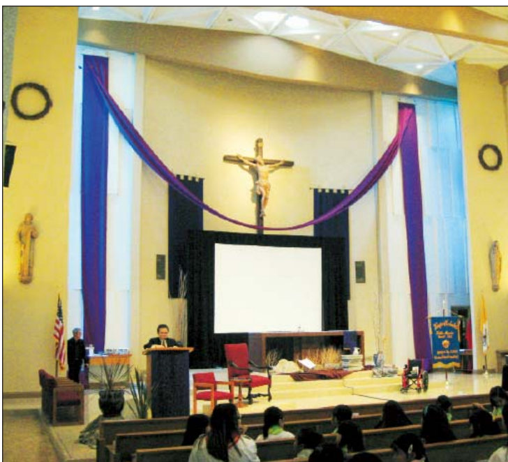
The altar of St. Christopher Church ready for the Wheelchair Sunday video presentation.