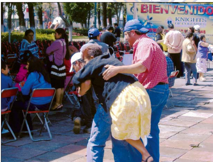
Knights Carrying a woman to get her wheelchair in Mexico.