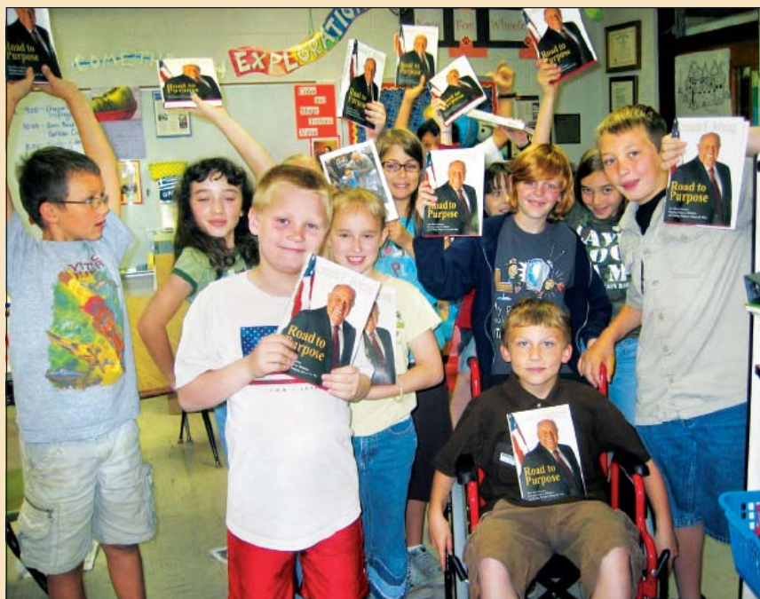
Tyson Tigers love "Road to Purpose".

an account of his personal journey that led to the creation of the Wheelchair Foundation , and the stories of people we have touched.