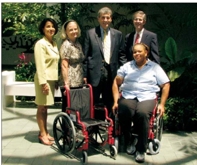
PBG Rotary Club Donates Wheelchairs.