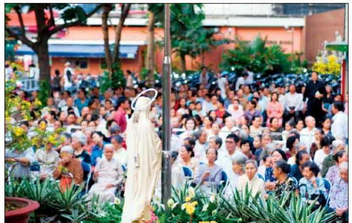
Knights Vietnam wheelchair ceremony.