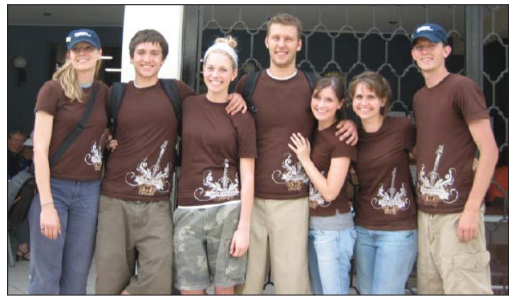
Rock the Block Crew in Lima, Peru.

goal is $21,000 by November 2008! We will host "Rock the Block" in July and September to continue to motivate students to get involved. Companies like Desert First Credit Union have offered to match the funds we collect from students on the nights of the events.