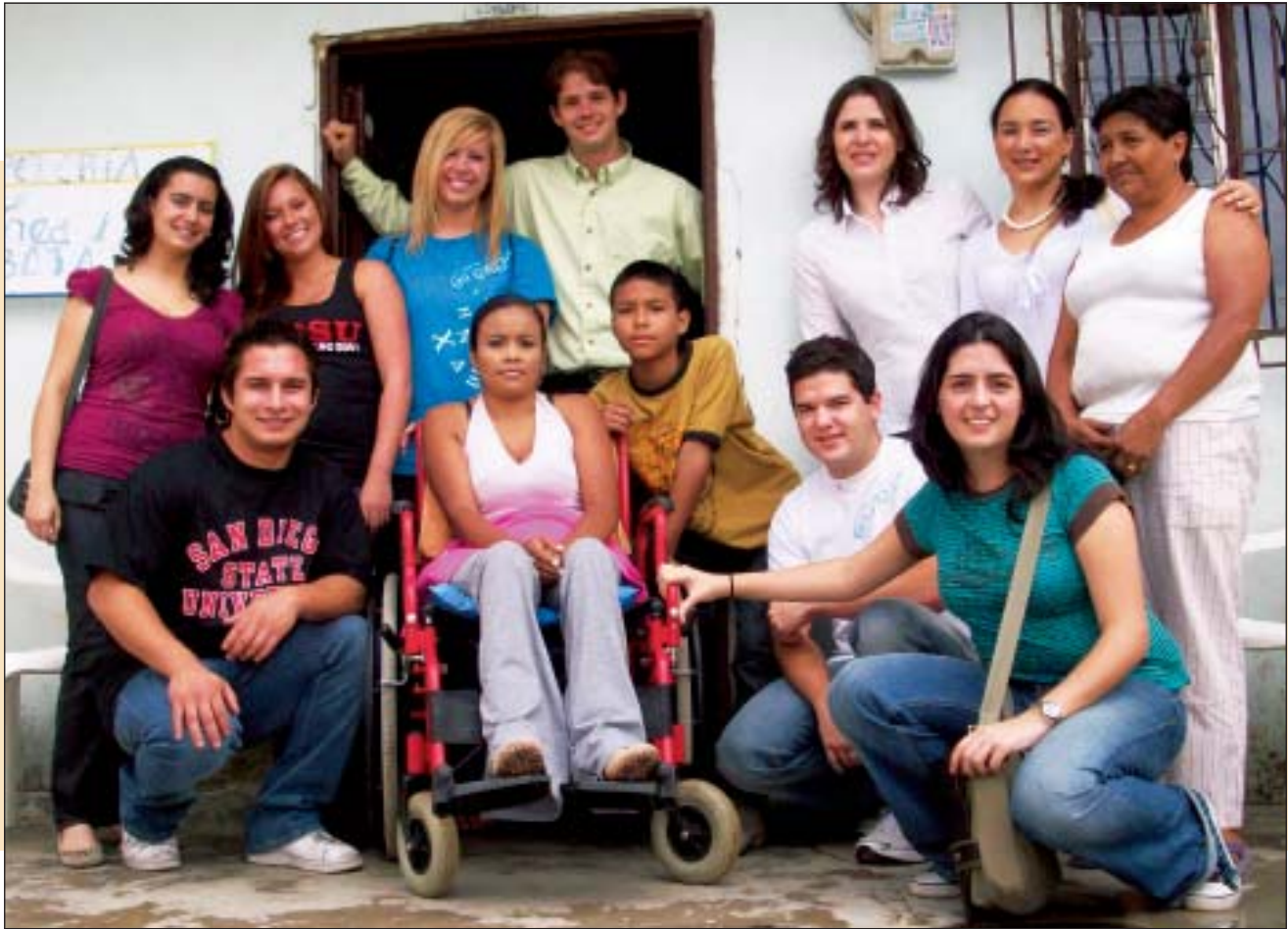
SDSU Students Reaching Out.