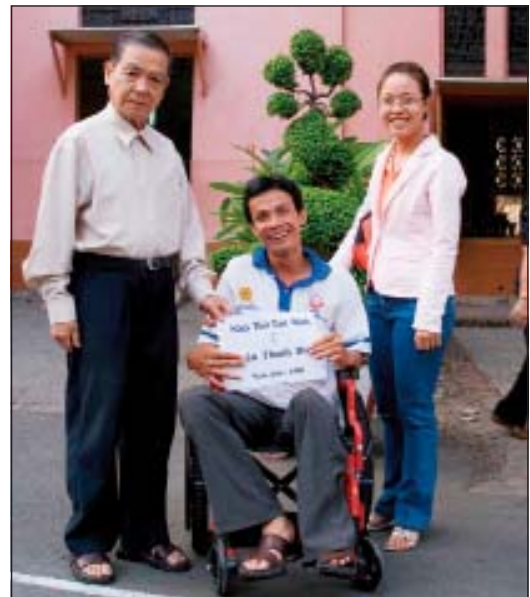
Knights Wheelchair distribution in Vietnam.