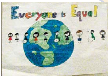
St. Christopher - Student Art.