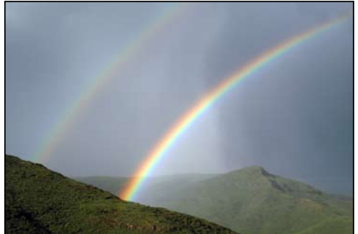
Above >> Lesotho's 2633 meter Blue Mountain Pass offers a spectacular double rainbow >> Left >> A happy recipient at the Martie Du Plessis School near Kimberley, South Africa >> Below Left >> Queenstown Rotaractors and members of ISIBINDI share in the joy of giving a wheelchair in Ilinge township.