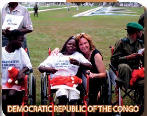
DEMOCRATIC REPUBLIC OF THE CONGO